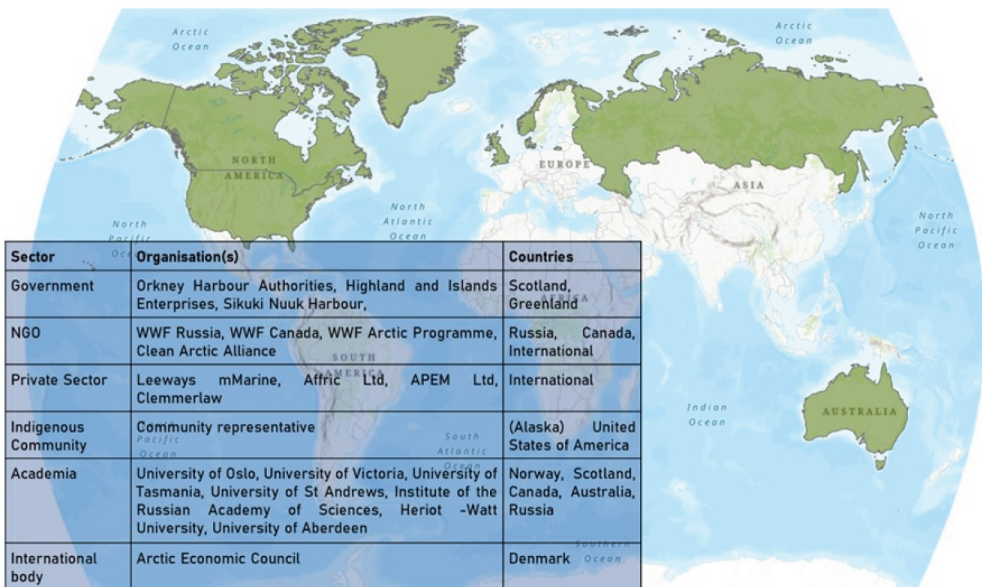
Figure 2. Stakeholder representation; green highlighted countries indicate countries represented.

Following the workshop, a project report was compiled by the workshop facilitators, and shared with workshop participants for comments and feedback. The final report summarises the workshop discussion points, and groups together similar topics to identify